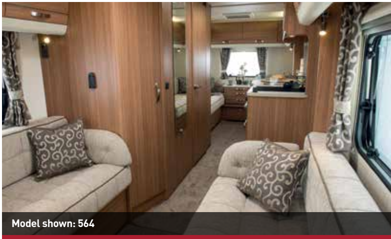
Model shown: 564