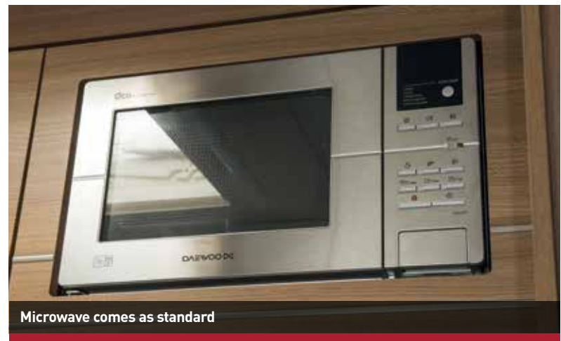
Microwave comes as standard