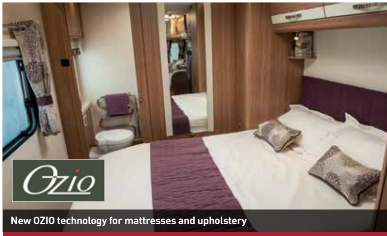
New OZIO technology for mattresses and upholstery