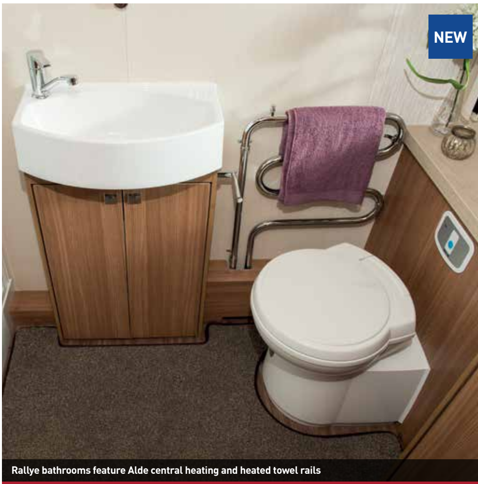
Rallye bathrooms feature Alde central heating and heated towel rails