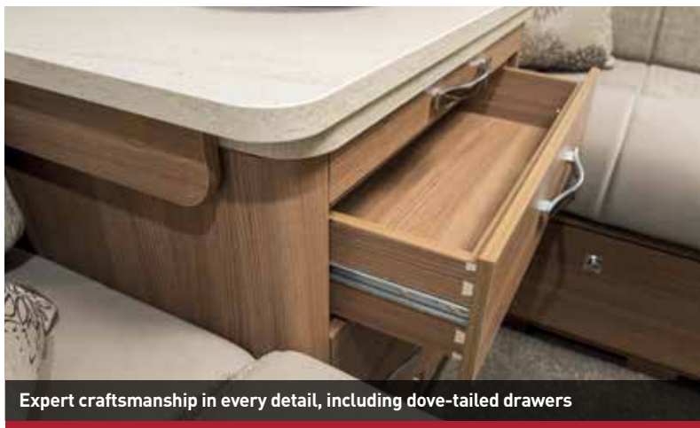
Expert craftsmanship in every detail, including dove-tailed drawers