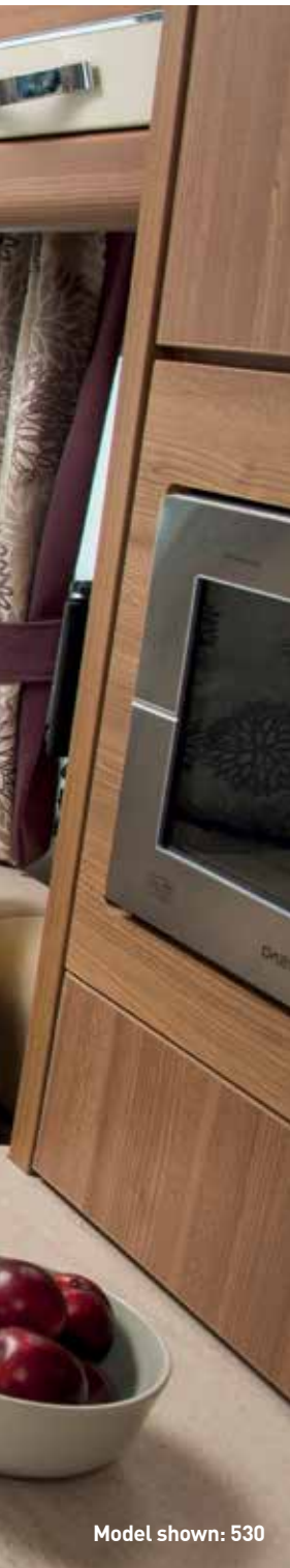
Model shown: 530