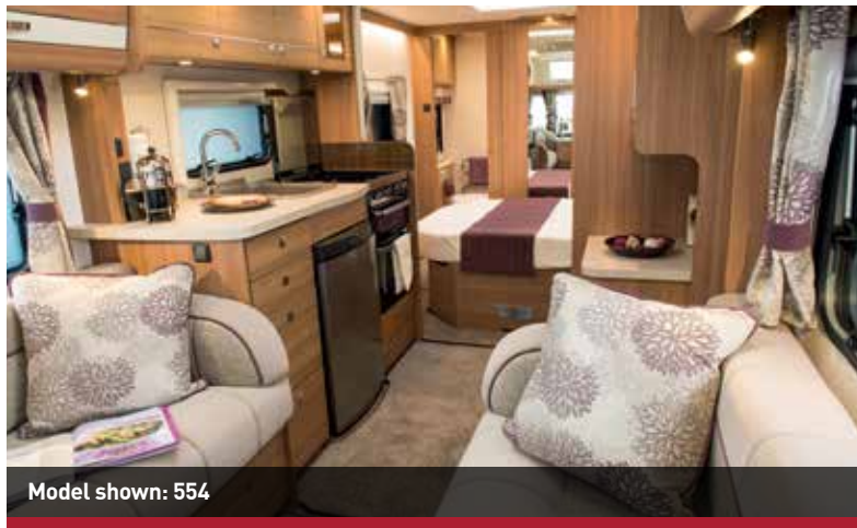
Model shown: 554