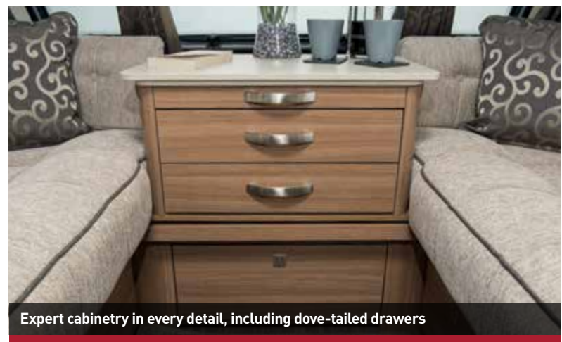
Expert cabinetry in every detail, including dove-tailed drawers