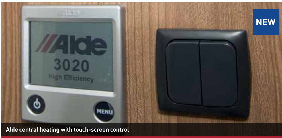
Alde central heating with touch-screen control