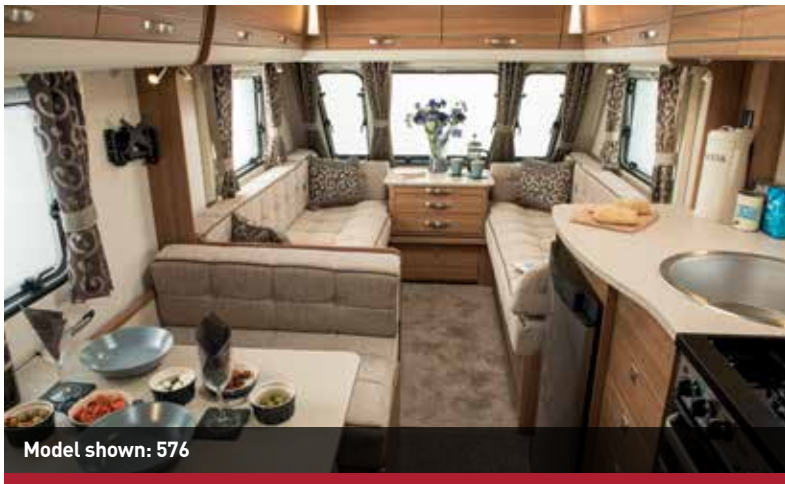
Model shown: 576