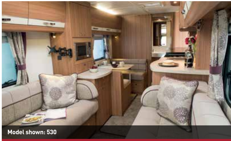
Model shown: 530