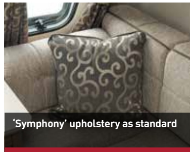
'Symphony' upholstery as standard

Change the look and feel of your Compass Corona with a choice of interior furnishings