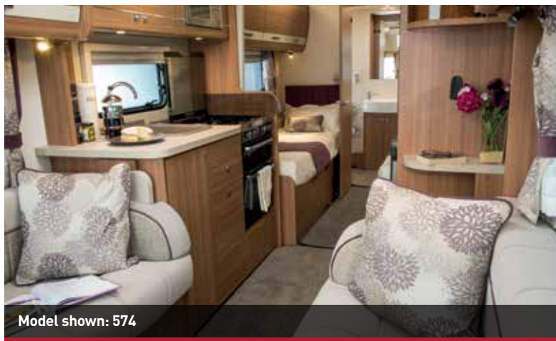
Model shown: 574