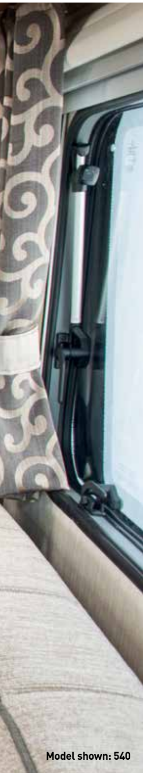
Model shown: 540