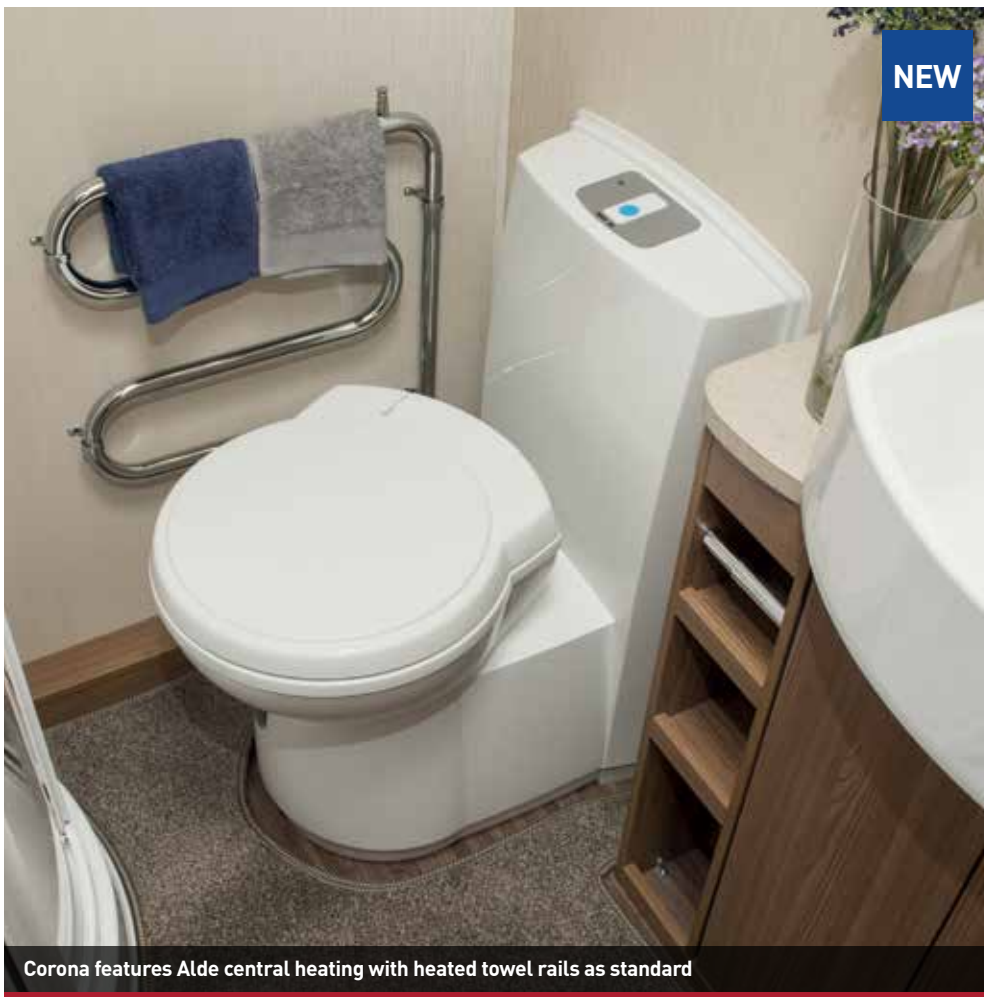
Corona features Alde central heating with heated towel rails as standard