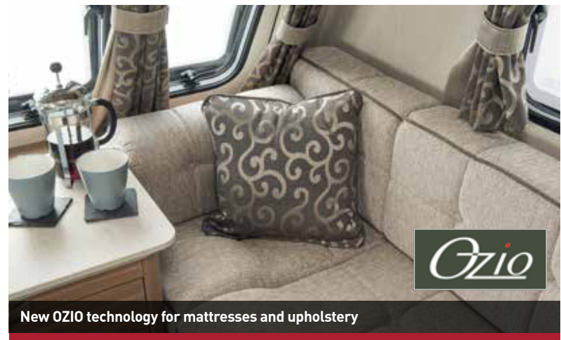
New OZIO technology for mattresses and upholstery