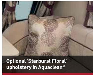
Optional 'Starburst Floral' upholstery in Aquaclean®