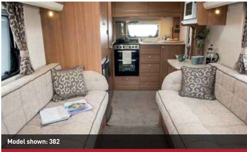
Model shown: 382