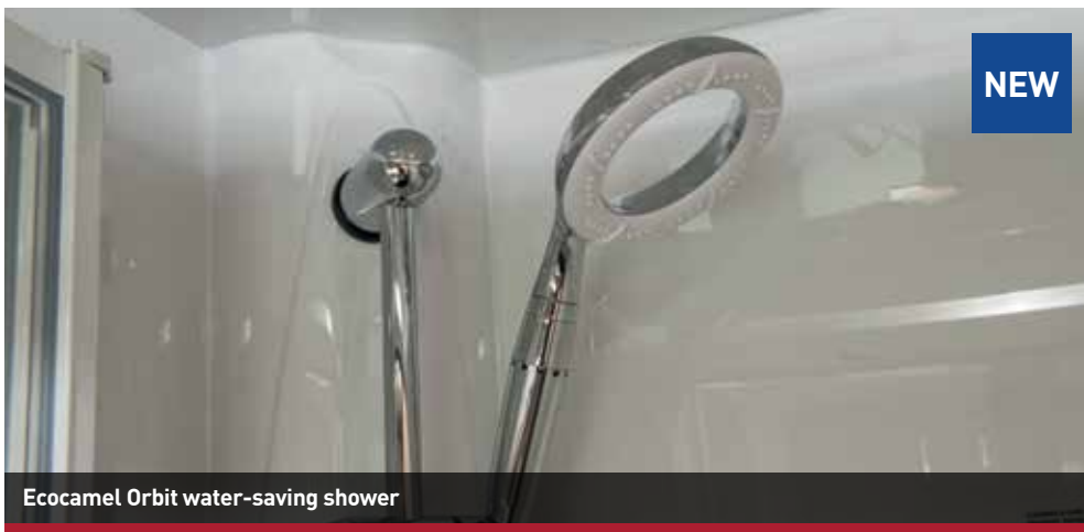
Ecocamel Orbit water-saving shower