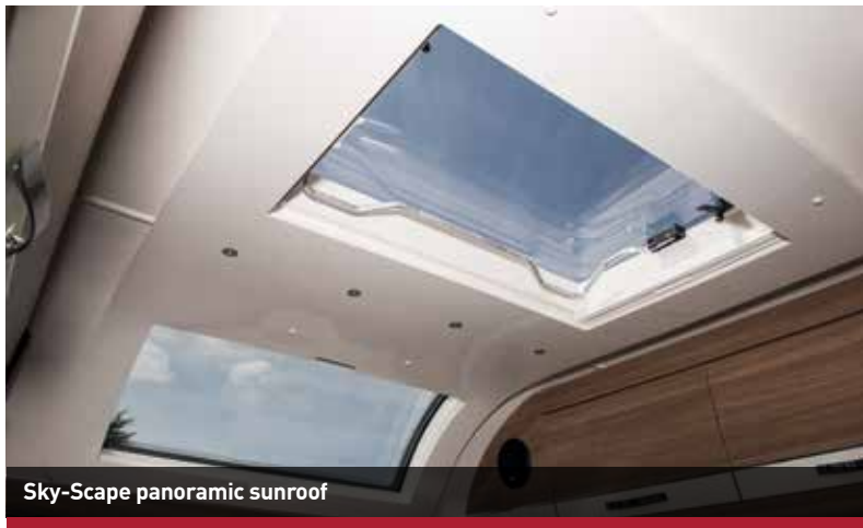
Sky-Scape panoramic sunroof