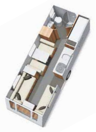
Xplore 586 Single Axle | 6 berth

▶ For prices, options and technical specifications go to www.elddis.co.uk