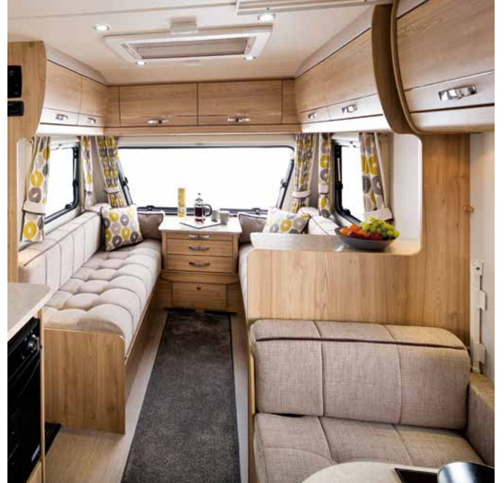
'Marone' craftsman-built cabinetry with dove-tailed drawers and Easy-Glide bed slats