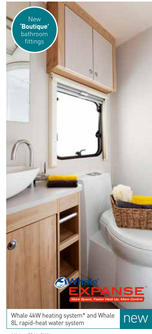
* Xplore 304 is 2kW