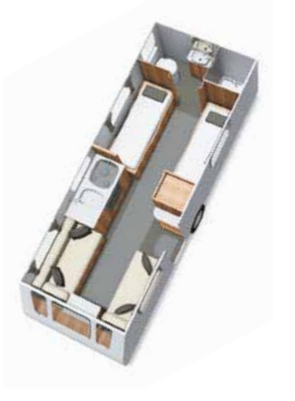
Xplore 574 Single Axle | 4 berth