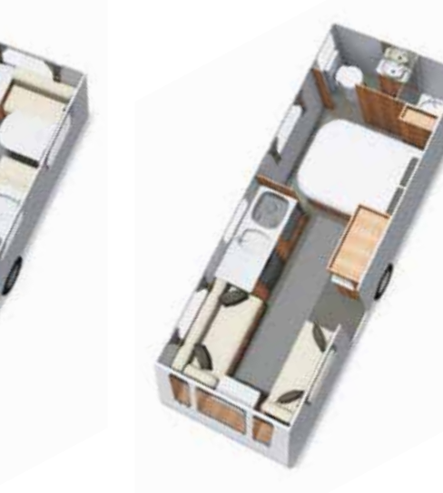
Xplore 526 Single Axle | 6 berth