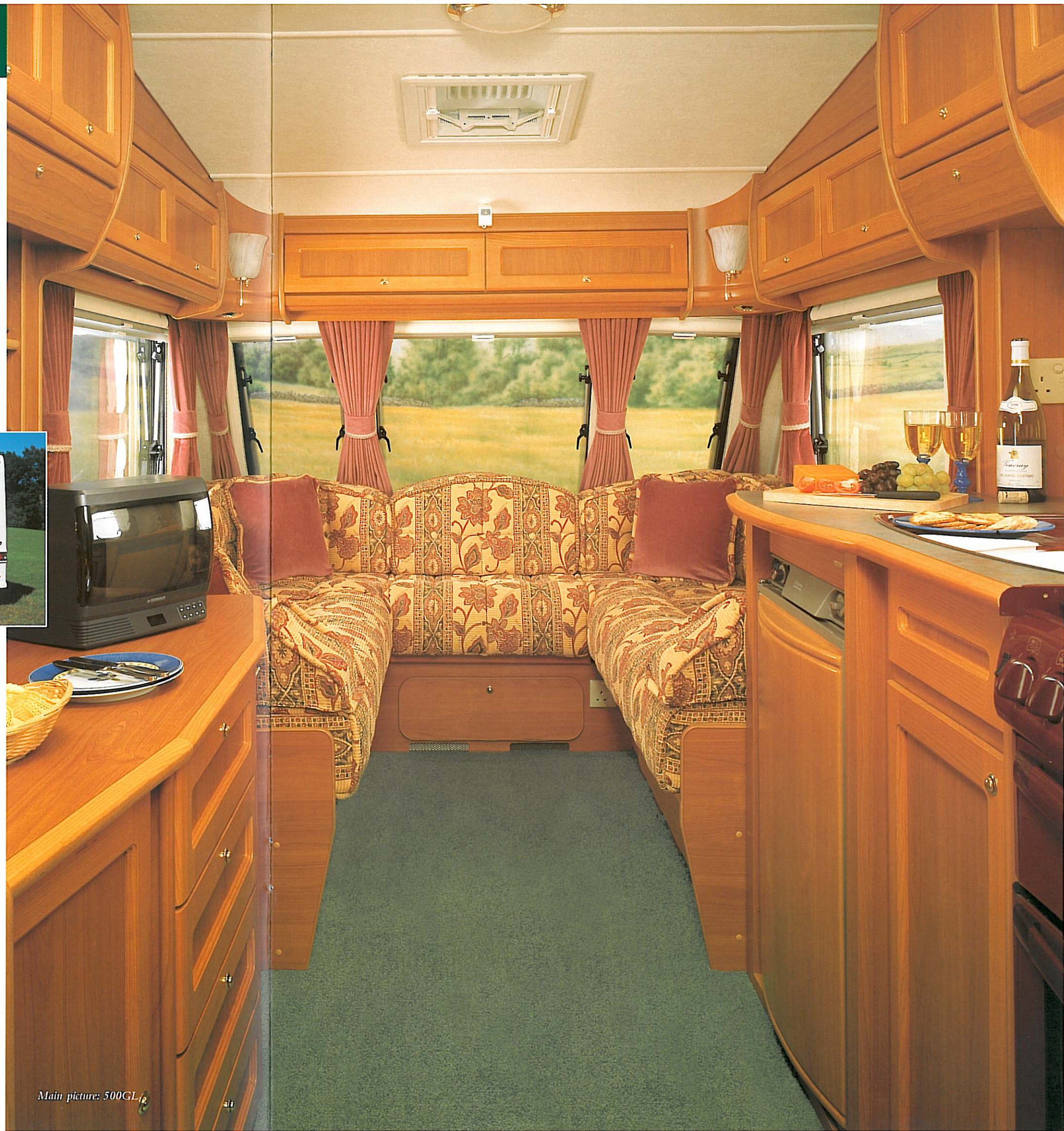
Main picture: 500GL