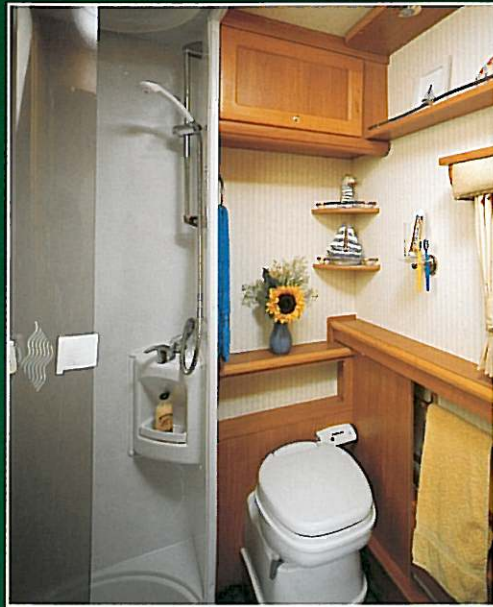
Main picture: 525SL