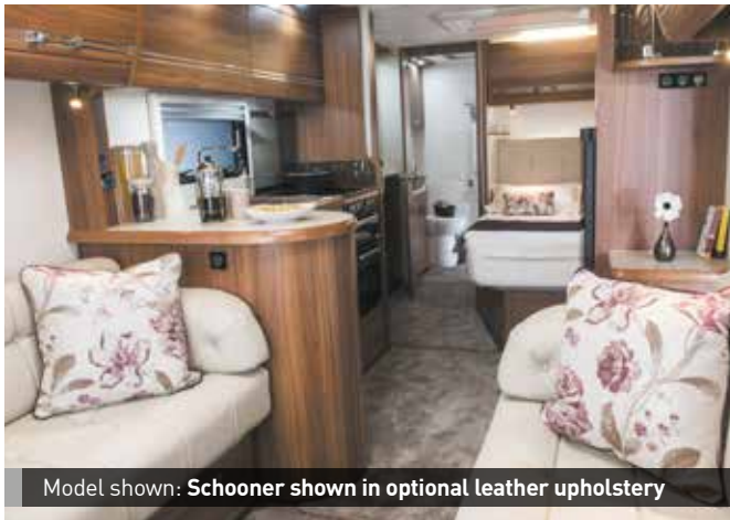
Model shown: Schooner shown in optional leather upholstery