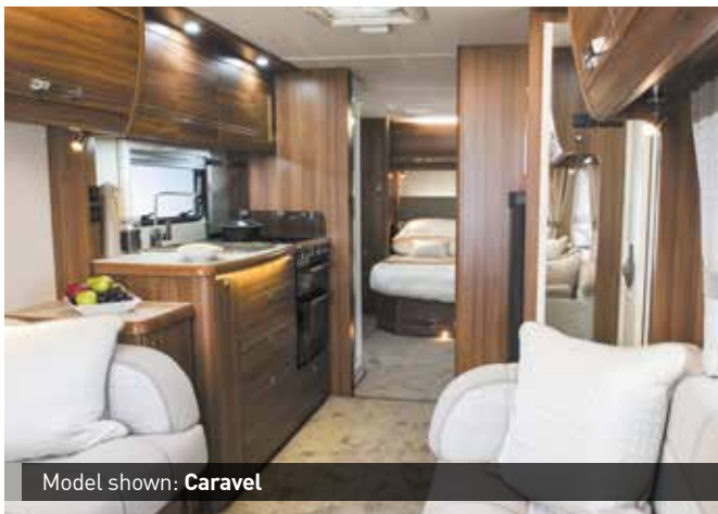
Model shown: Caravel