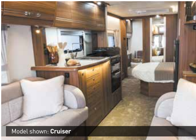
Model shown: Cruiser