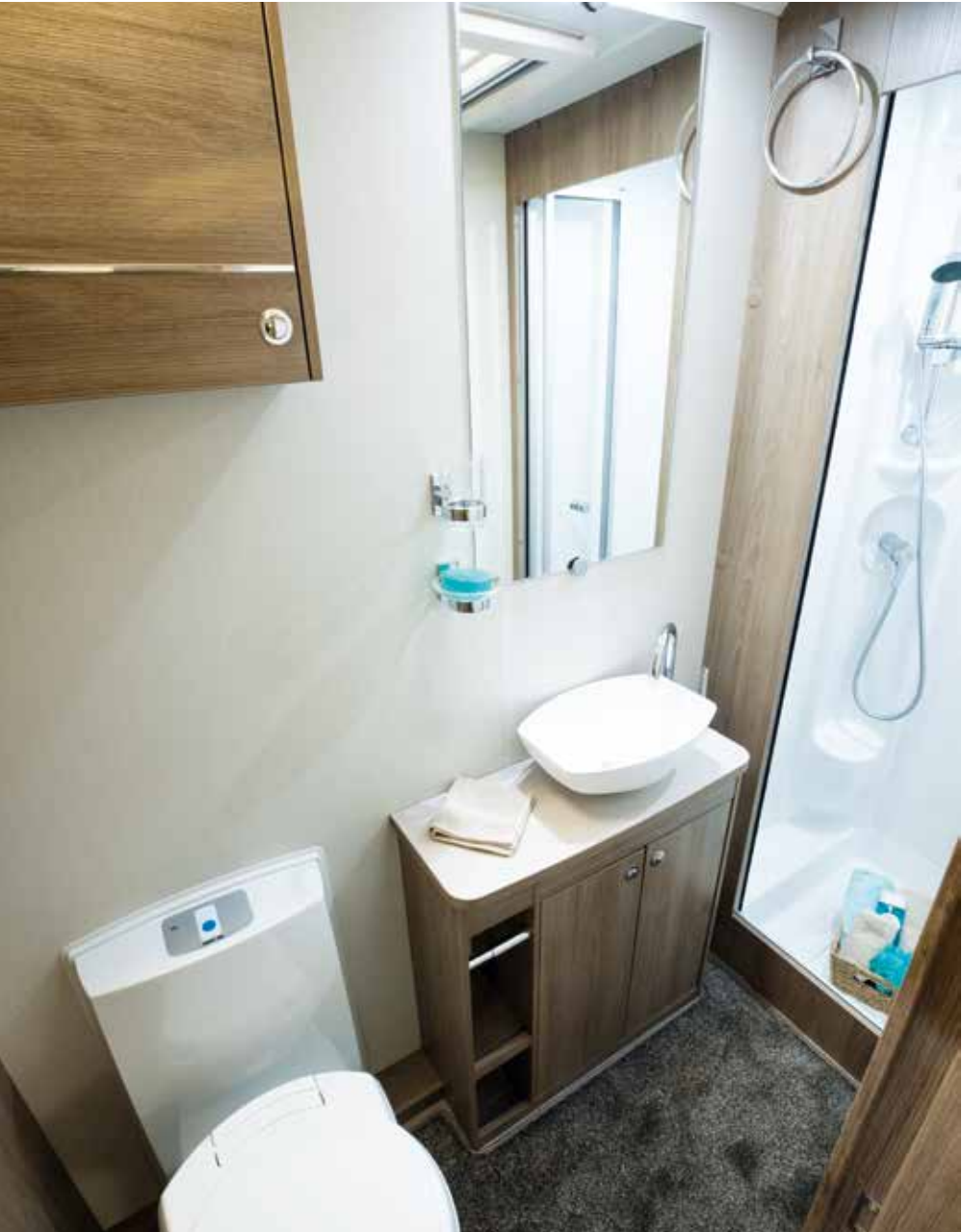
Whale Expanse dual-fuel water heater (8L) for super-fast heat up times.