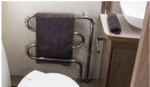
With Alde 24hr programmable central heating and hot water - plus Ecocamel shower and heated towel rail, Capiro bathrooms provide more than a touch of luxury.