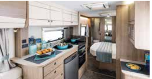
Whale 4.3kW dual-fuel heating - underslung, creating even more storage space.