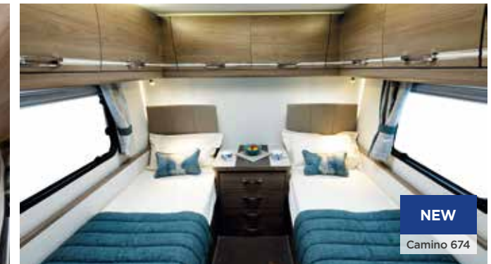
NEW Camino 674