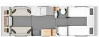
Twin Axle / 4 Berth

An exciting new twin axle layout, the new Camino 674 boasts a superbly comfortable twin bedroom at the rear with a centrally-located bathroom, which can be used as an en-suite or as a family bathroom.