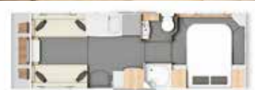
Twin Axle / 4 Berth