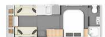
Single Axle / 4 Berth