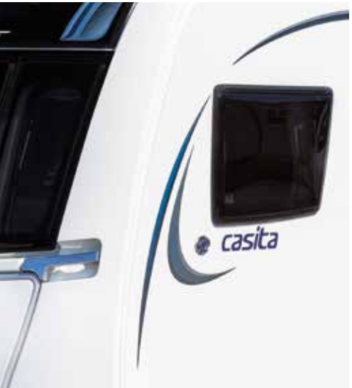
Stronglite Aluminium one-piece sides are up to 40% stronger and 30% lighter.