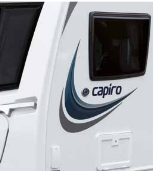
Stronglite Aluminium one-piece sides are up to 40% stronger and 30% lighter.