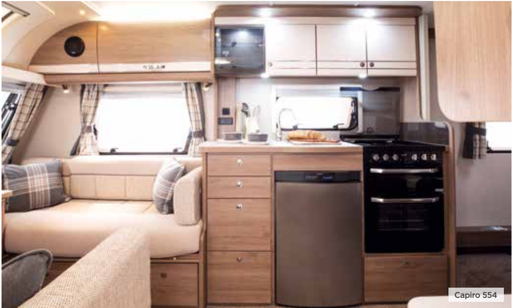
Capiro kitchens include dual-fuel hob, microwave, oven and grill, plus cocktail cabinet* and external gas BBQ point.