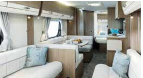
OZIO seating and mattresses - ultimate support and comfort.