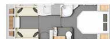
Single Axle / 4 Berth