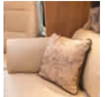
Optional 'Cardinal Mirage' leather option available on fixed bed models (255 and 265)