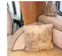
Optional 'Paradiso' Aquaclean® upholstery

Under 2.8m height • Less than 2.2m (7ft) width • Less than 6m length • 6'4" internal headroom