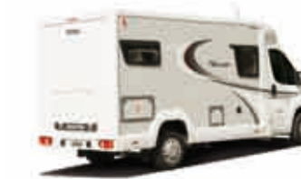
With rear 'garage' access & storage