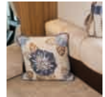
'Atlantic' upholstery standard in Autoquest