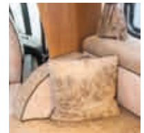
Optional 'Paradiso' Aquaclean® upholstery