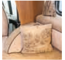
'Paradiso' Aquaclean® upholstery standard in Aspire