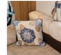
'Atlantic' upholstery standard in Accordo